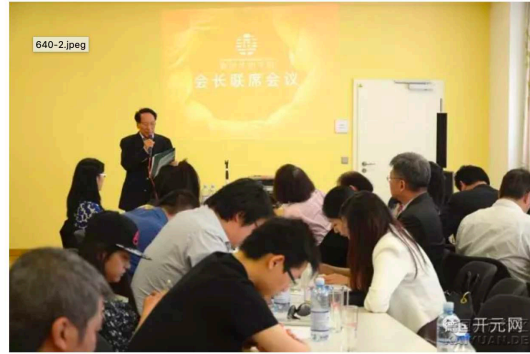
A 2015 meeting in Frankfurt discusses the establishment of “Chinese Aid Centers” in Germany. According to a 2016 report in the Chinesische Handelszeitung , the centers help China’s five regional consulates in Germany to find students who have “lost contact”, and offer translation, and legal and medical aid. 9

ciety – even many Chinese and non-Chinese members may be unaware of their exact nature or function – and likely number over a thousand, since they are present (with some variation) in every country. 8