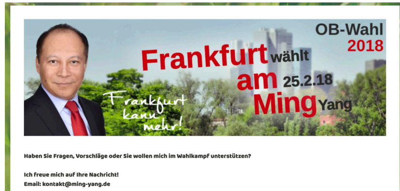
Yang Ming's mayoral campaign website.