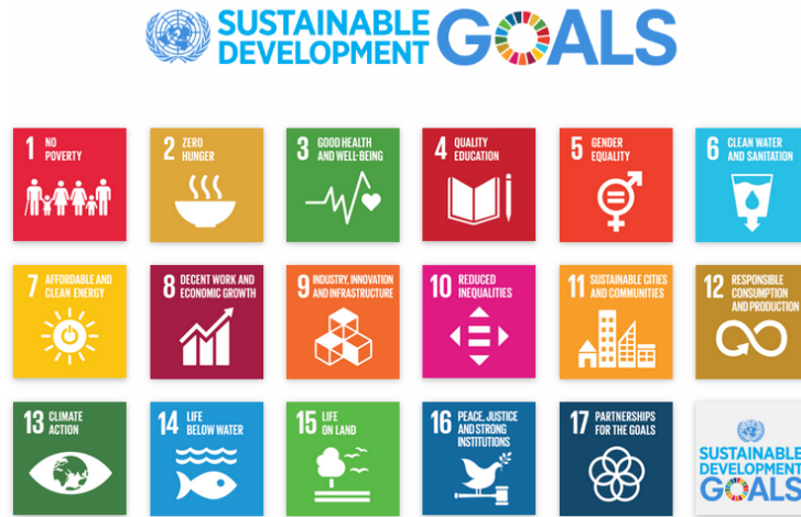
The Sustainable Development Goals.